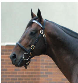
Street Cry (IRE)

Three grade I winners on one day in late September, and a pair of Breeders' Cup winners and likely Eclipse champions in English Channel and Curlin, are among the accomplishments on Smart Strike's 2007 resume. Smart Strike shattered the (Continued on page 2)